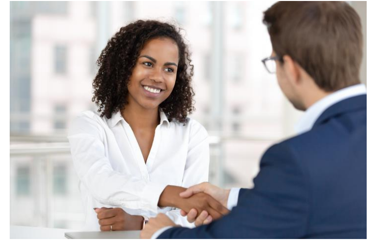
Recruitment to the Profession